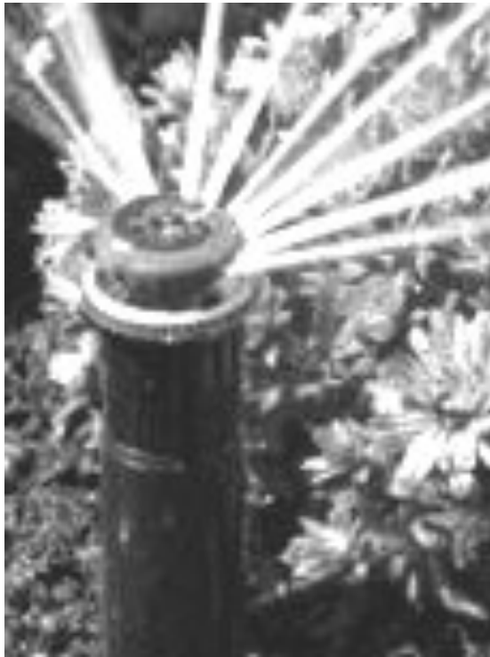
MP Rotator: Pop-Up Sprinkler Hunter Industries Resource Guide

http://www.hunterindustries.com/resource_guide/